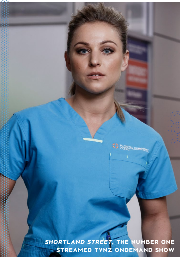
SHORTLAND STREET, THE NUMBER ONE STREAMED TVNZ ONDEMAND SHOW

TVNZ OnDemand has performed extremely well, with ongoing growth in total video streams and audience reach propelling online revenue growth of 26% year-on-year. Viewer experience has been enhanced with the launch of individual profiles, and the new 'ad on pause' functionality has increased value for advertisers. TVNZ is keeping pace with global scale online streaming competitors, illustrated by Horizon Research recognising TVNZ OnDemand as New Zealand's most used online content service during 2019, ahead of Netflix," he says.