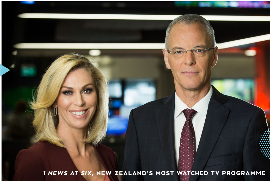
1 NEWS AT SIX, NEW ZEALAND'S MOST WATCHED TV PROGRAMME